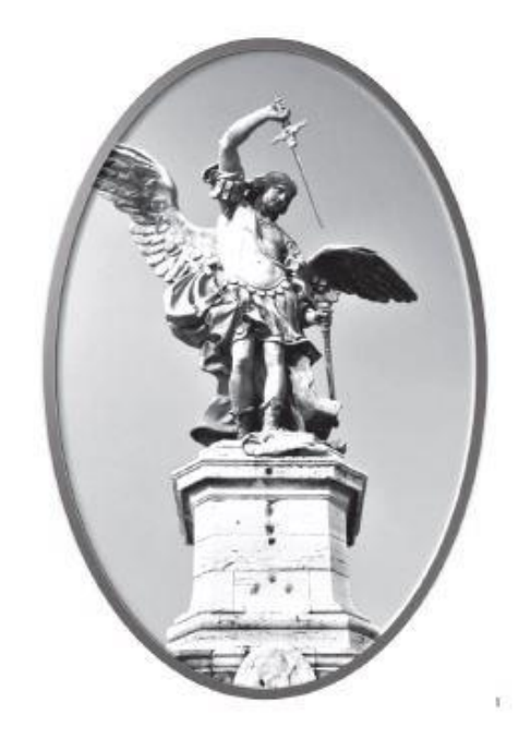
Rome, Italy (Castel Sant'Angelo)

St. Michael the Archangel, Ambassador of Paradise, pray for us.