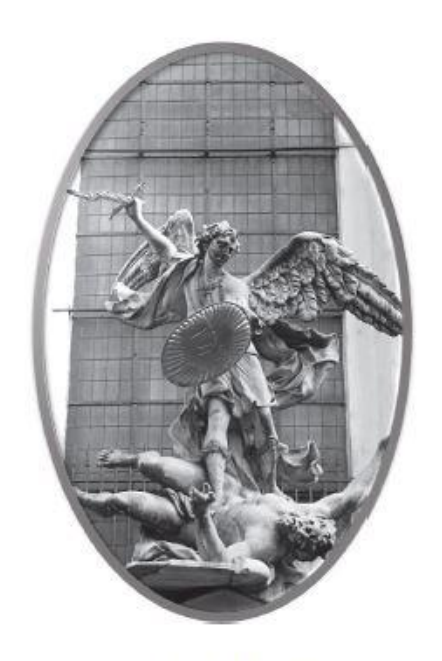
Vienna, Austria (Michaelskirche)

St. Michael the Archangel, Brave Defender of those who hope in God, pray for us.